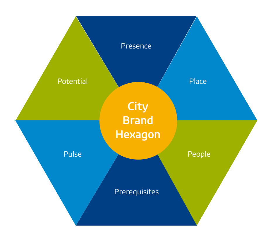
The City Brand Hexagon

North America: Chicago, Denver, Los Angeles, New York, Philadelphia, Seattle, Toronto, Dallas Fort Worth, Houston